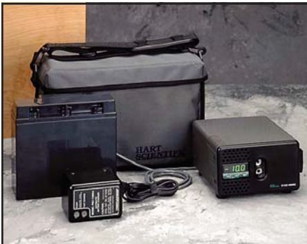
Model HT9102 shown with battery pack, which includes a battery, carrying bag, cables, and charger.

HT9100 fixed-block options. Order number HT9100S-A or HT9100S-D for the desired block option.