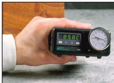
Take the HT9100 anywhere. It's the smallest dry-well in the world.

Plug it in, switch it on, set the temperature with the front-panel buttons, and insert your probe into the properly sized well. Compare the reading of your device to the display temperature or to an external reference, and the difference is the error in