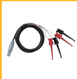
Universal RTD Adapter