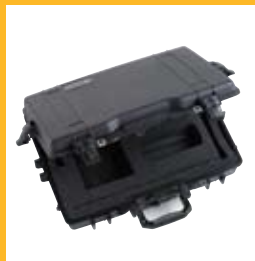
Probe and Readout Case