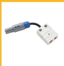
Universal Thermocouple Adapter